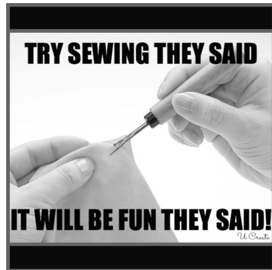
Just For Fun

Does matching patterns in your fabric make you want to 🤔 🤔?