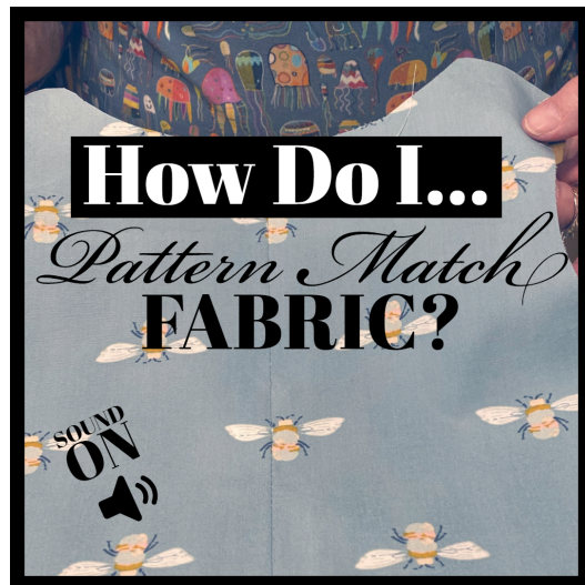
A Plano ASG Tutorial Short

In case you missed it, here are the a couple of our favorite posts from last month.